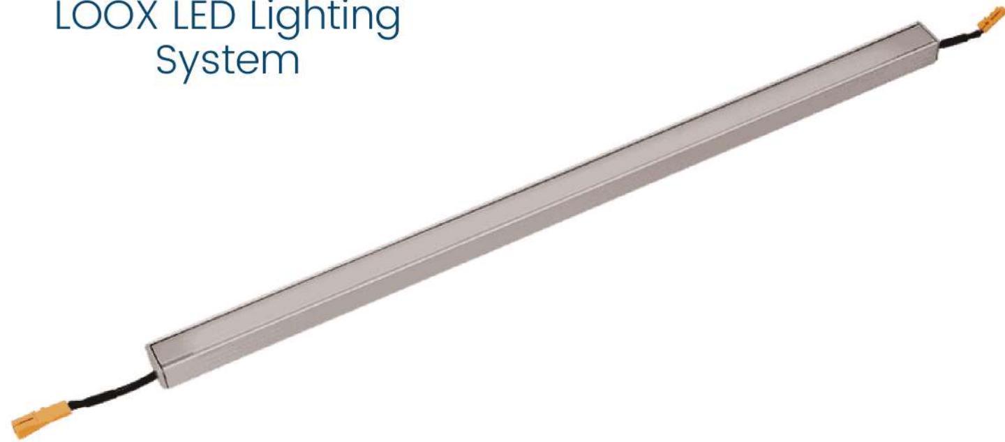
LOOX LED Lighting System