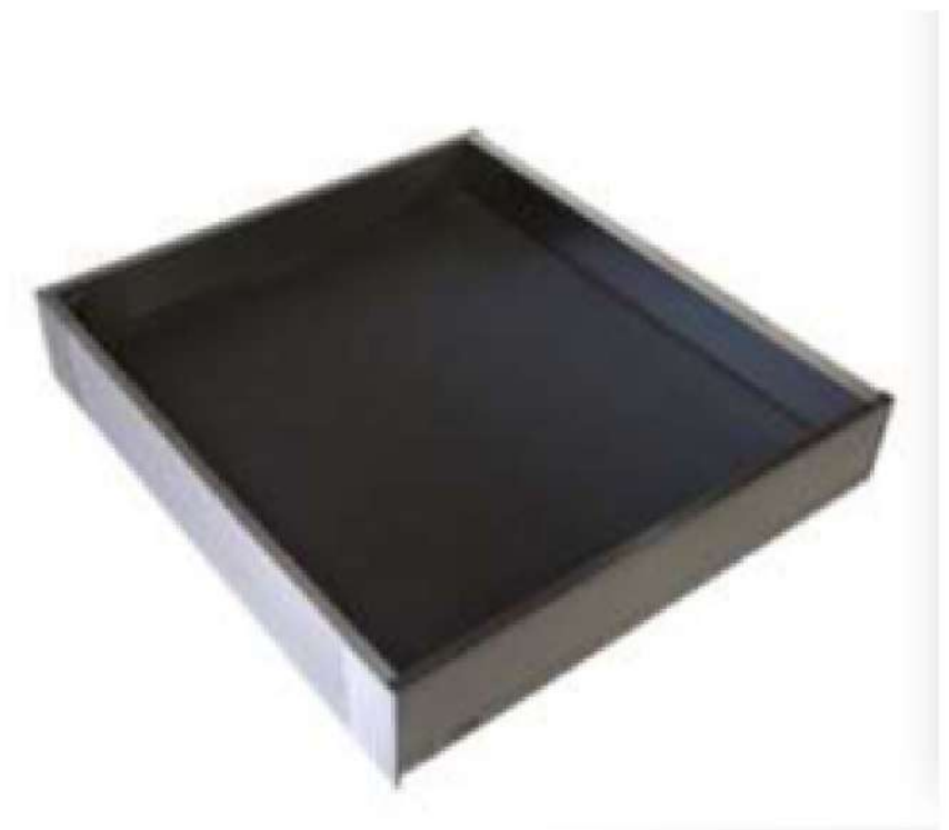
Metal Roll Out