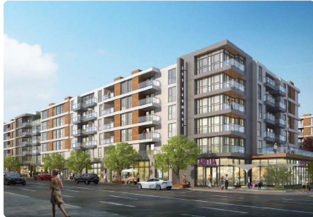
200 Vermont 490 Units - Los Angeles