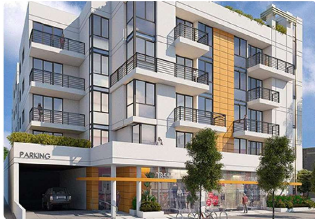
1855 Westwood 60 Units - Los Angeles