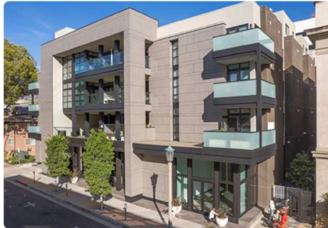
178 S Euclid 42 Units - Los Angeles