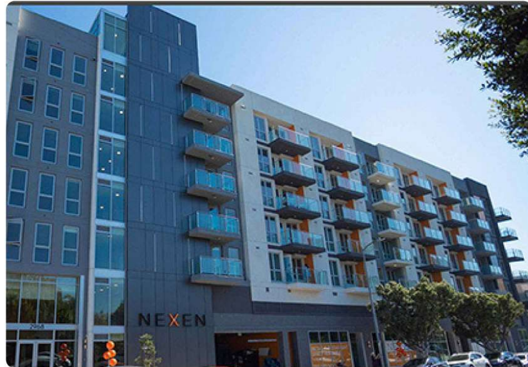
2972 W. 7th 228 Units - Los Angeles