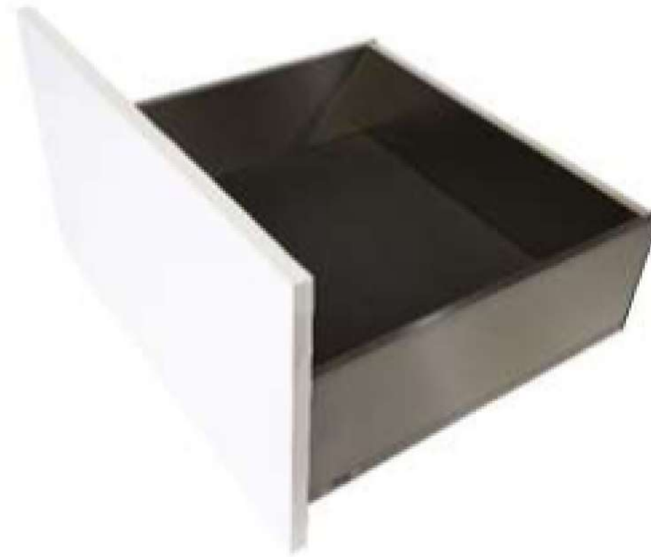
Metal Drawer Large