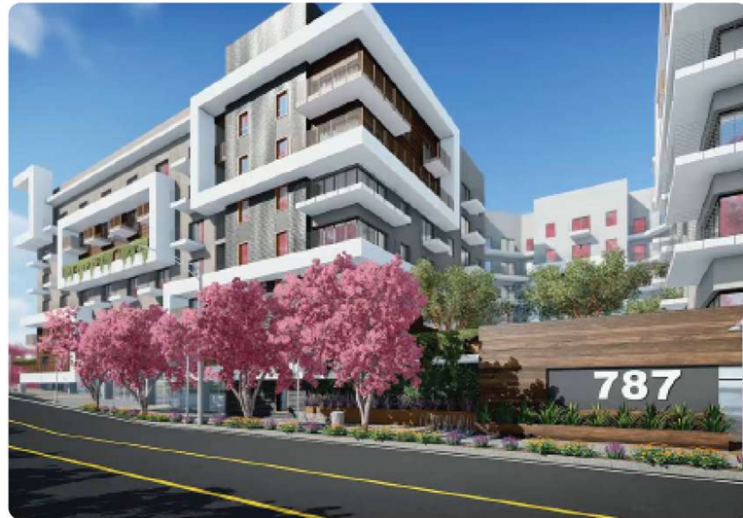
777 N. Front St 573 Units - Los Angeles