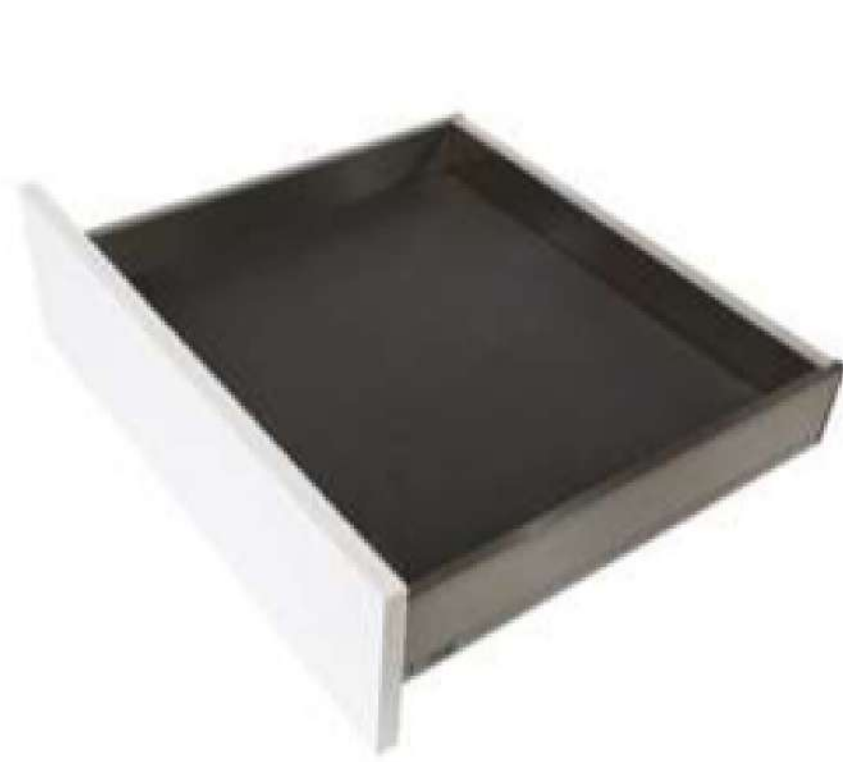
Metal Drawer Small